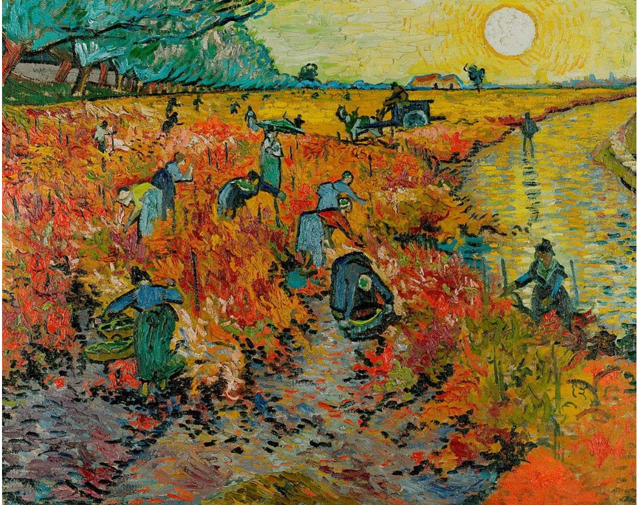
The Red Vineyard. Vincent van Gogh