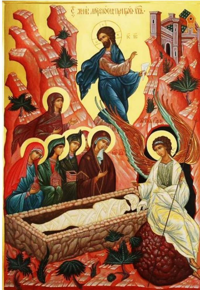
The Holy Myrrh Bearers