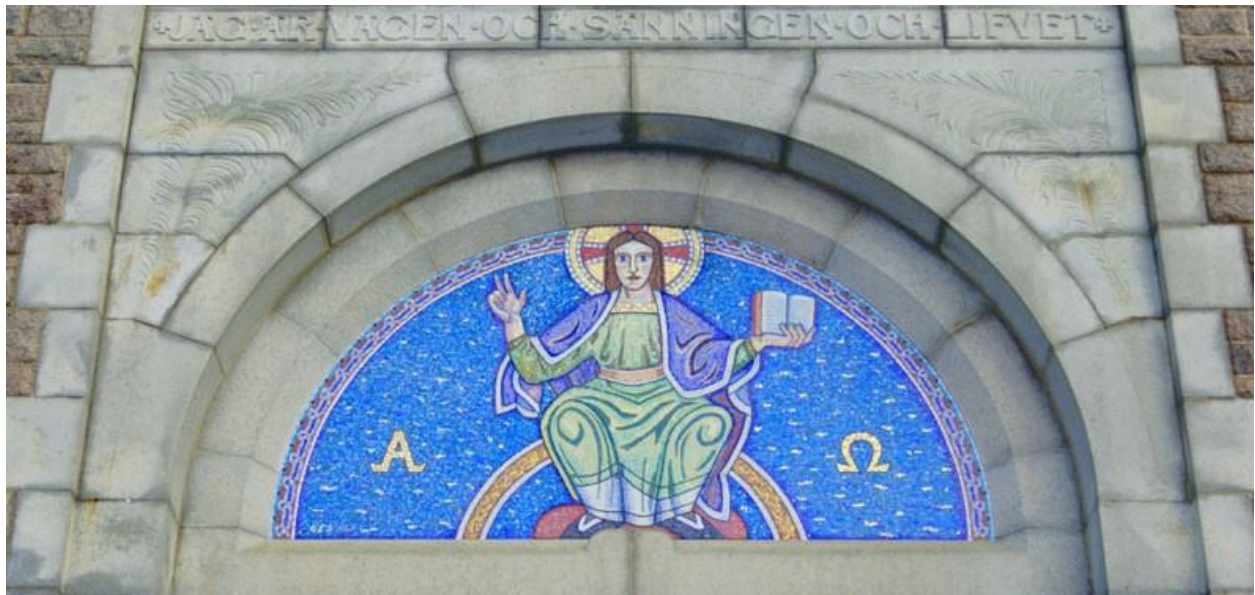
Vasakyrkan, Gothenburg, Sweden. " Jag är Vägen och Sanningen och Lifvet. " (Translation: "I am the Road, the Truth and Life.")