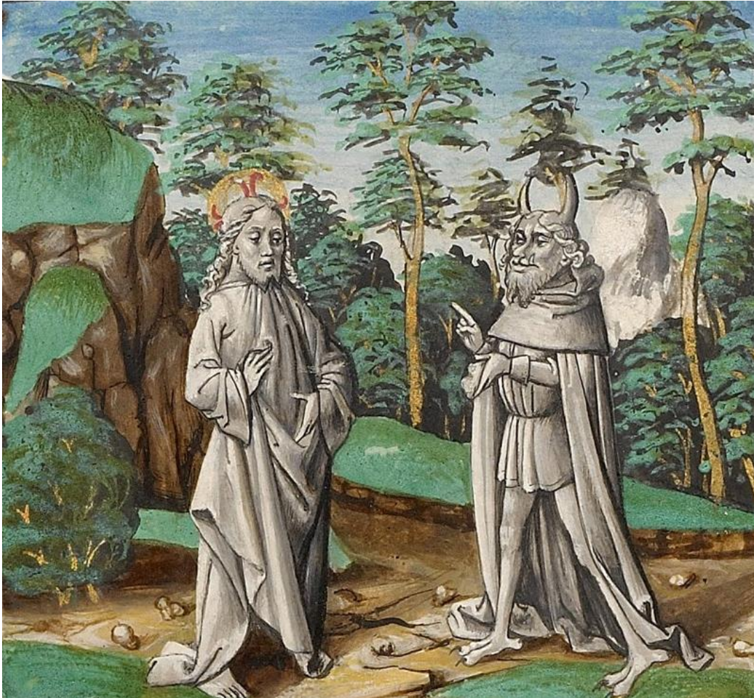
First Temptation of Christ. Date: ca. 1475 Artist: Anonymous First Temptation of Christ