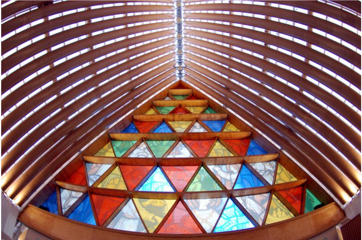
Transitional Cathedral, Christchurch, New Zealand. The world's only cathedral made substantially of cardboard