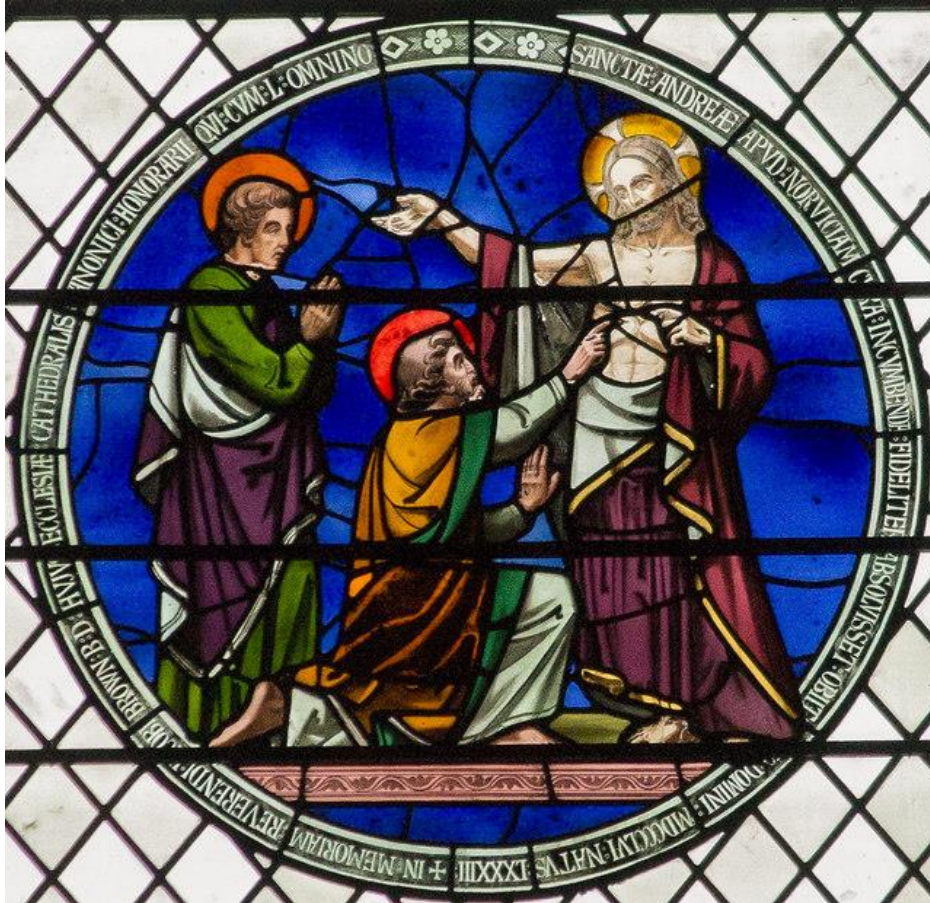
Doubting Thomas stained glass. Norwich Cathedral.