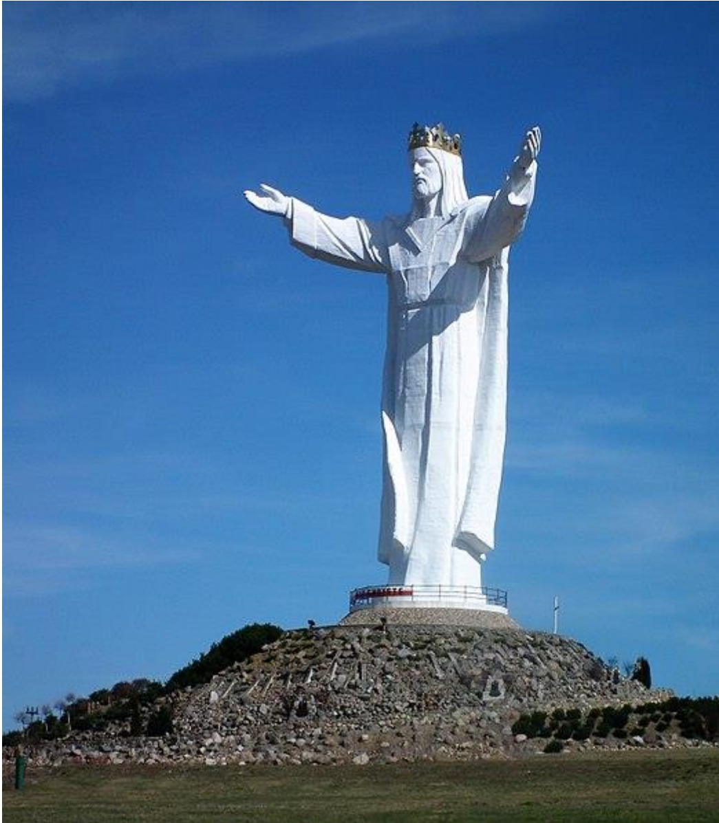
Christ the King in Swiebodzin, western Poland.