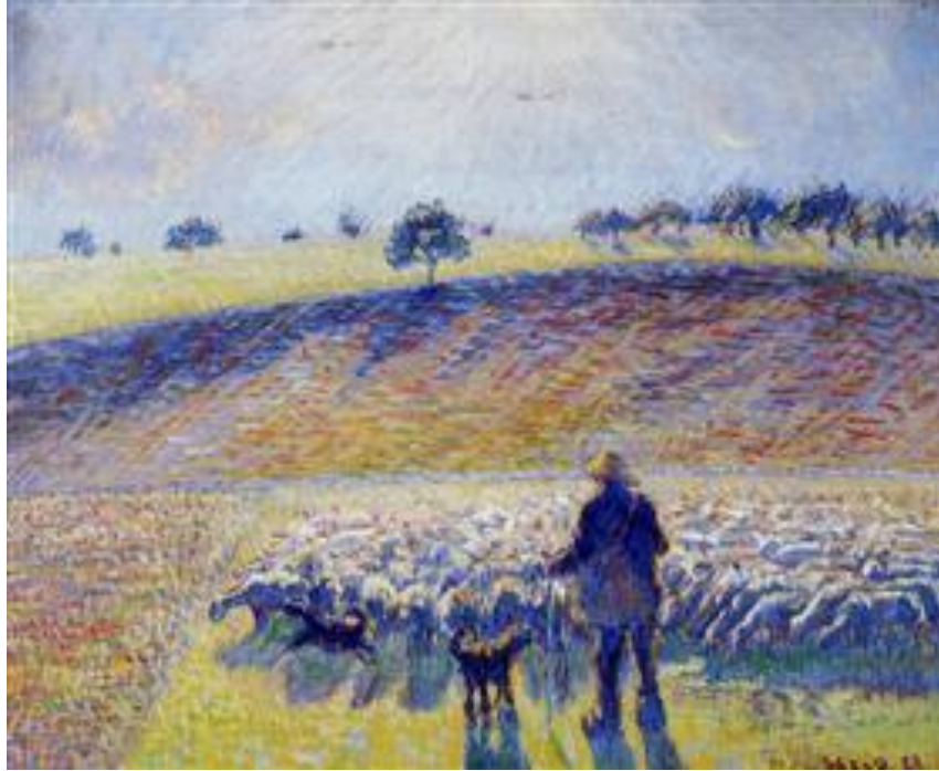
Shepherd and Sheep. Camille Pissarro.